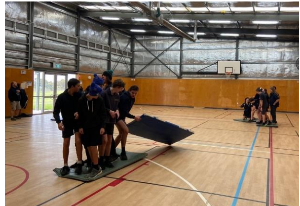
Each group approaches each challenge differently due to their communication, coordination and problem-solving skills.

Just ask a year 9/10, is it really that hard to lower a hoop to the ground as a team?